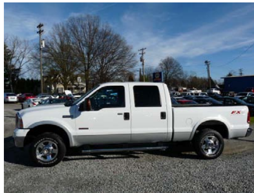
WHITE FORD F250